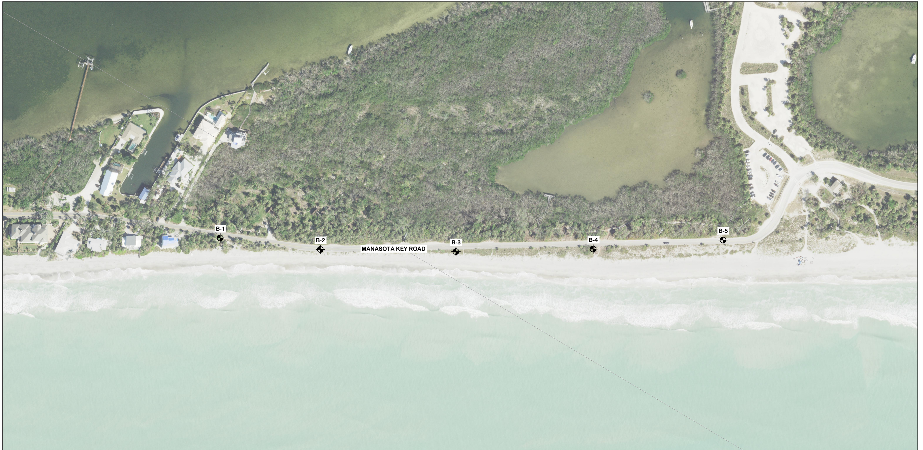
AERIAL FROM 2023 (BEFORE STORM EVENTS)